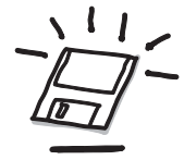
Appendix 30: Art-at-Work fund-raising packet

The second step was to develop a fund-raising packet. The first page of the packet is a collage of news clippings about Art-at-Work, followed by a letter from the executive director explaining the benefits of the Art-at-Work program and the amount being requested. Also included are a budget, sponsor benefits, samples of the youths’ artwork, and photos of the youth. The packet is placed in a box decorated by an artist. The box also contains a mosaic designed and created by one of the youth. (Several items from the packet are included in Appendix 30 .)